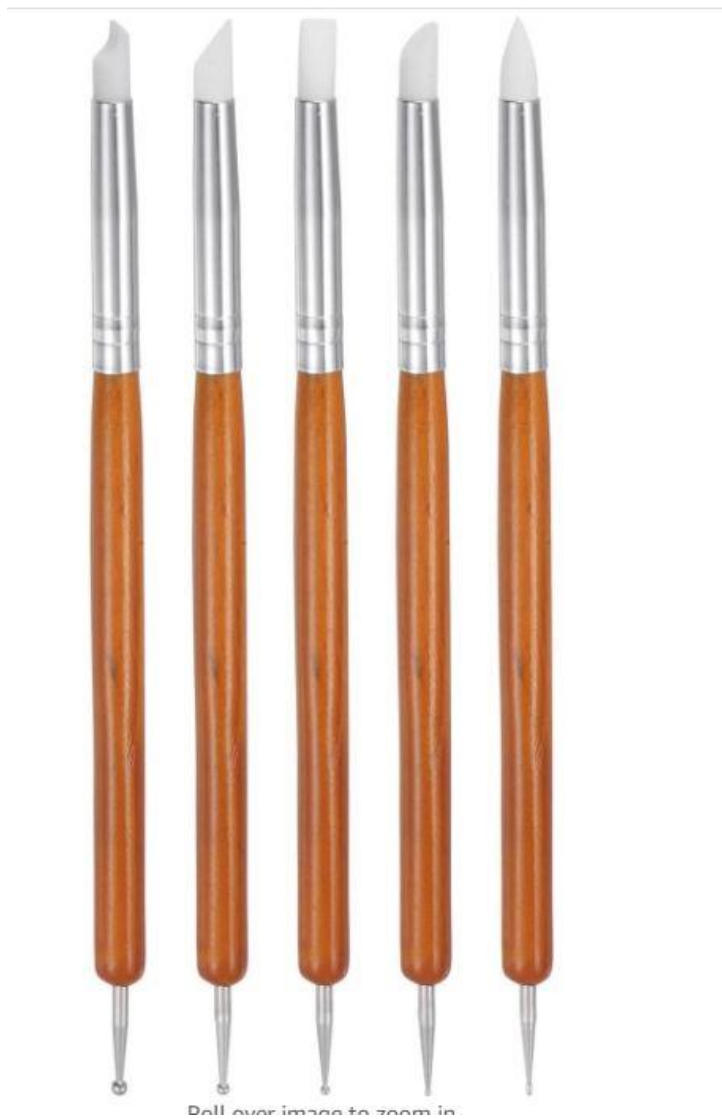
Clay sculpting tools