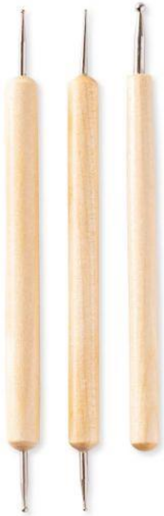
Embossing stylus tools

May want to cut off rounded tip and/or add soft pencil grips to the handles.