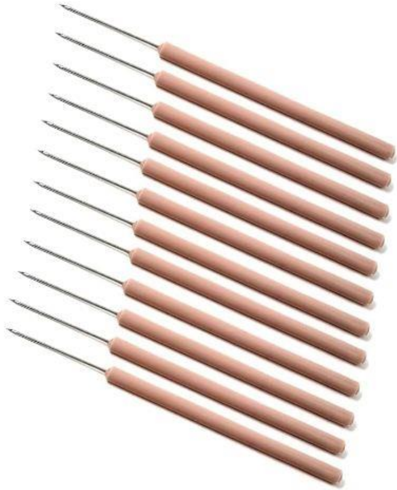
Lab dissecting probes